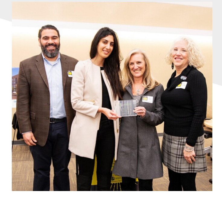
WE received the Community Partnership Award from The Sacramento Housing Alliance for giving women a RE-start.