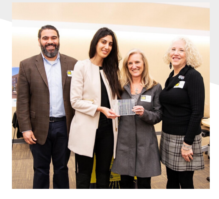
WE received a Community Partnership Award from The Sacramento Housing Alliance for giving women a RE-start.